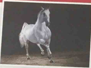
can meet the riders, feed the horses and enjoy a light lunch at Cafe Capriole.

T oday on page six, we explore Midrand – home to the Mall of Africa, Kyalami Grand Prix Circuit and so much more. We tell you more about this fast-growing area and share with you some of our favourite places to eat, things to do and some of the top schools in the area.